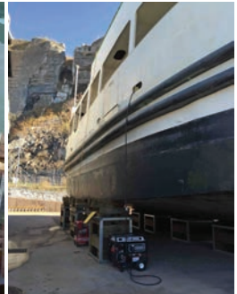
Maid of the Mist boats in dry-dock. Equipment and materials had to be hoisted into boats for project.