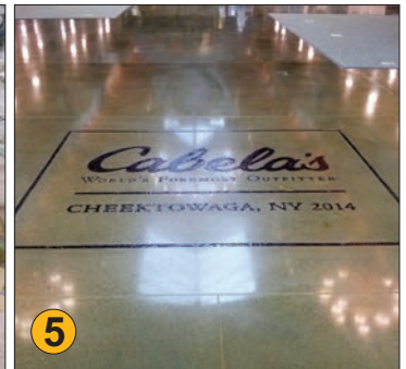
Photos: (1) (Top Right) Inside finished Cabela's store; (2) Initial grinding of new concrete, preparing for polish; (3) Section of polished concrete aisle; (4) Decorative concrete staining of intricate floor profile for waterfall exhibit; (5) Cabela's logo stenciled and stained by The MJA Company

• For more about Cabela's, visit www.cabelas.com