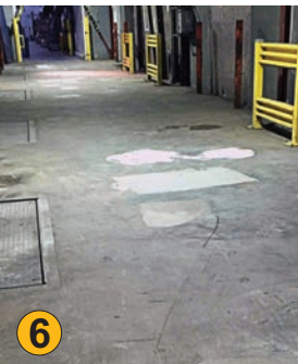
Photos: (1) (Top Right) Removal of spalled floor sections; (2, 3) Closeup of damaged flooring; (4) Leveling floor after repair; (5) Patched area leveled and cured; (6) Overview of repaired areas, lighter colors show some of the repaired areas.

• For more about Perry's Ice Cream, visit www.perrysicecream.com